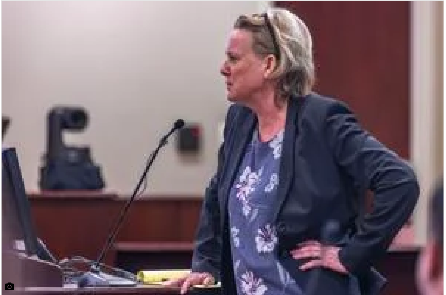
Baldwin hearing to pick back up Monday after audio issues